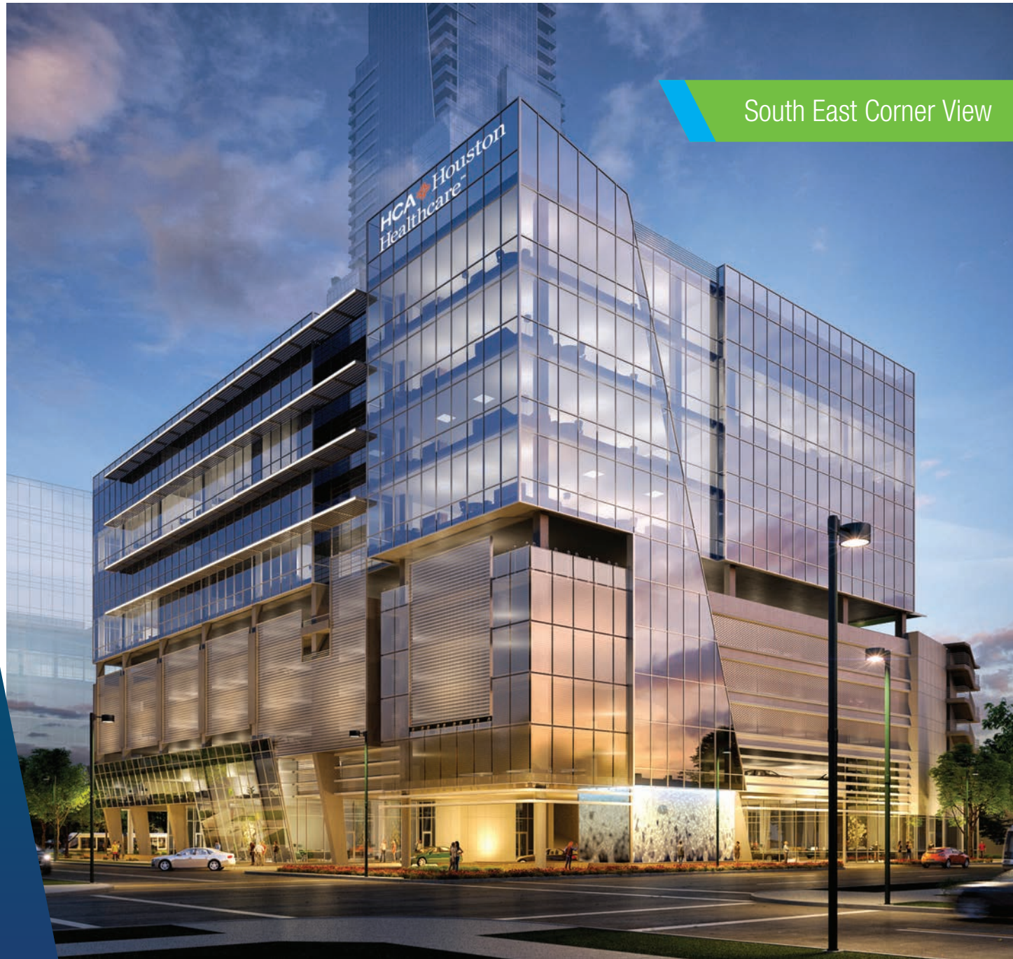
South East Corner View